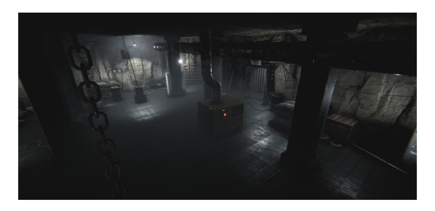
Tales Of Escape Activation Code

Download ->>> <a href="http://bit.ly/2SIvJa0">http://bit.ly/2SIvJa0</a>